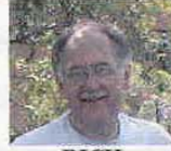
RICH "PRETTY BOY FLOYD" LESLIE