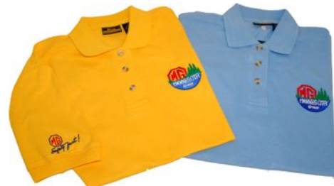
MMGG POLO SHIRTS ($24.00 each)