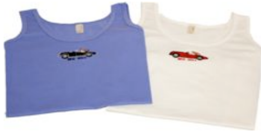
MG Girl Tank Top ($12.50 each)

To place orders contact: Cindy O'Brien randycindy@earthlink.net