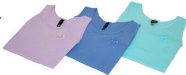
MMGG Tank Tops ($12.50 each)