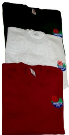
MMGG Sweatshirts ($27.00 each)