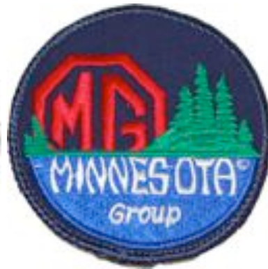
MG Patches ($7.00 each)

There are many more options of clothing not shown here when ordering MMGG Regalia. Ask Cindy if you want to see the various styles of: