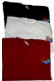
MMGG Sweatshirts ($27.00 each)