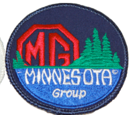
Short Sleeve T-Shirts MG Patches ($7.00 each)

There are many more options of clothing not shown here when ordering MMGG Regalia. Ask Cindy if you want to see the various styles of: