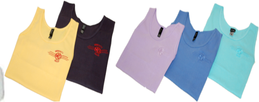
MG Girl Tank Top ($12.50 each) MG Girl Patches ($7.00 each) MMGG Tank Tops ($12.50 each)