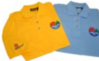
MMGG POLO SHIRTS ($24.00 each)