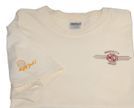
Short Sleeve T-Shirts $15.00 each