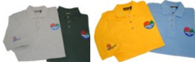
MMGG POLO SHIRTS $24.00 each